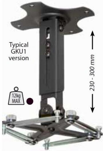
Typical GKU1 version

These universal mounts offer a wide range of adjustment not only to cover widely differing projector screw fixing centres but also allow clearance for contour variations often found in projector design. A universal screw pack to cover most projectors is included.