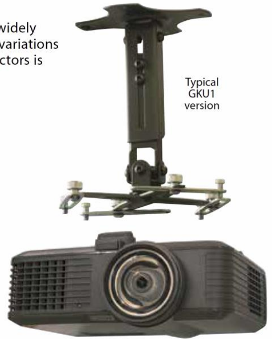
Typical GKU1 version