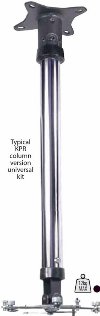
Typical KPR column version universal kit