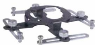
EU Registered Design 00221072-0001